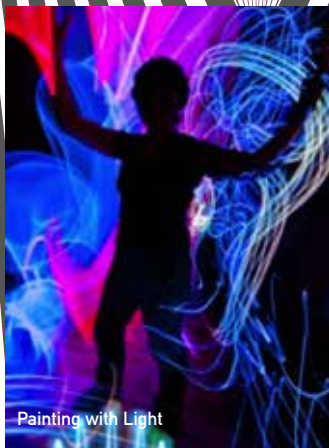
Painting with Light