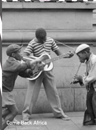
Come Back Africa