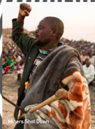
Miners Shot Down